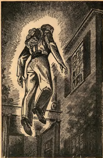
2 In the darkness his body glowed with an eerie light as he floated beside the house...